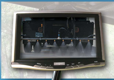
Choice of 7" or 9" Monitor

Camera Systems for the DOT, Government & Municipal Markets