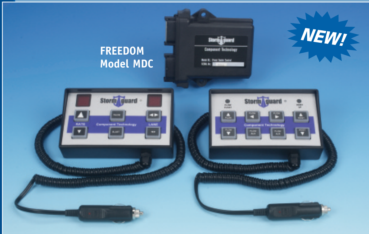
FREEDOM Model MDC

Unprecedented freedom and portability in a small, efficient Control System package