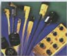
TPE Wiring Connectors