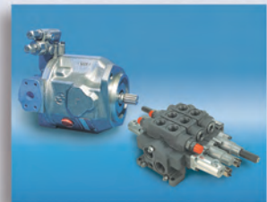
Pumps & Valves