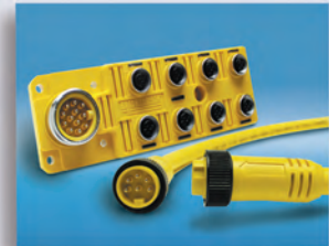
TPE Harness System