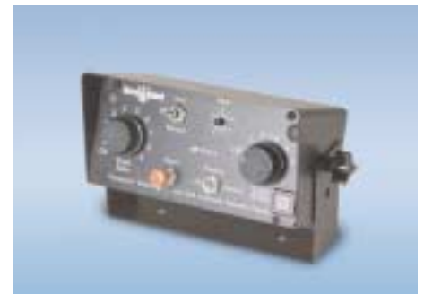
Model SG 10/11 are also available with AS2 ground speed spreader control

Give us a call and find out where you can get into a demo truck, stop by our booth at one of the many trade shows or contact your local dealer and see firsthand how the StormGuard line of control consoles fits and feels.