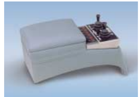
Model SG 11 shown with joystick and saddlebag