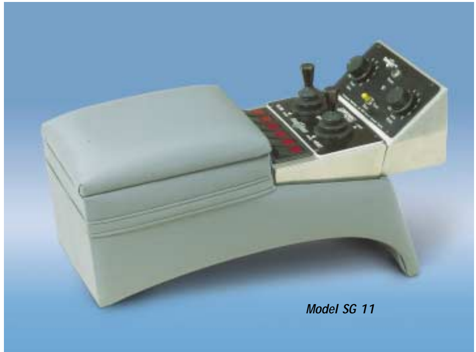
Model SG 11

The new StormGuard line of control consoles have been re-engineered for today's challenges in the Snow and Ice Industry. In keeping with our traditional console designs that have serviced the market for many years, we have added more variety and flexibility to allow you to better customize your system to fit your needs.