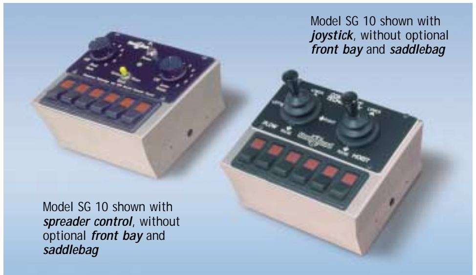
Model SG 10 shown with joystick , without optional front bay and saddlebag

Component Technology is a pioneer in snow and ice removal. We definitely have the experience to do the job. From the operator to the fleet manager we understand what you need. That's why the entire StormGuard product line, top to bottom, is the best available when you compare safety, reliability, durability, and ease of maintenance. Our engineering staff consistently proves that it is the most innovative in the industry. This makes us the best at bringing your ideas to reality. We can help you design systems and controls that will do your job right and do it well. We are here to serve you and believe that our total commitment to your success is the key to our mutual success.