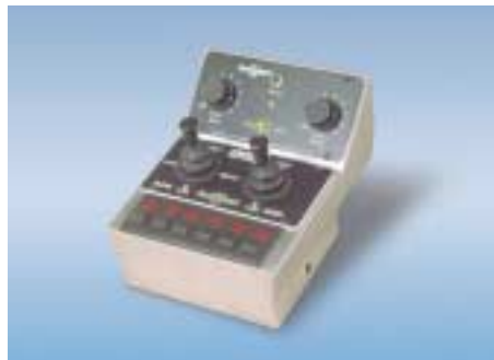
Model SG 10 with optional front bay